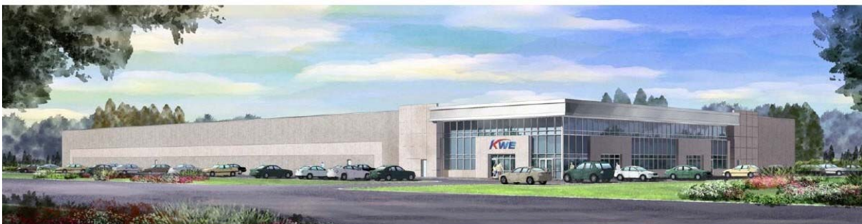
NEW GUELPH FACILITY - KINTETSU WORLD EXPRESS (CANADA) INC