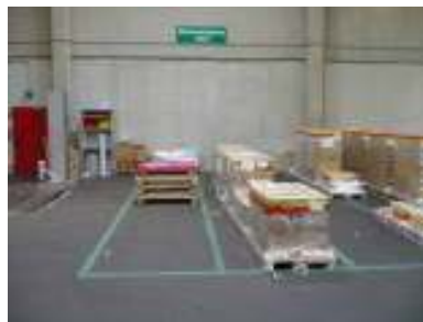
Vendor to Vendor