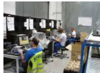
PDI area (pre-delivery inspection)

8,500 sq meter (91,494 sq ft) Bonded Warehouse