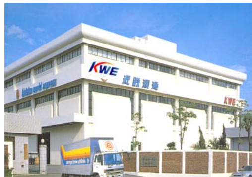
KWE Taoyuan Warehouse

KWE Taoyuan is a TAPA Class "A" certified facility and its ILC operations have started physical operation on July 1.